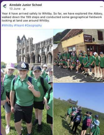
On a trip to Whitby, Year 4 learned about its geography and went down the 199 steps!