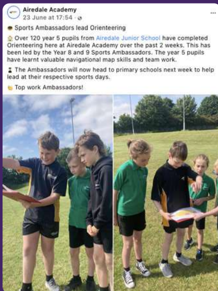
Over 120 Year 5 pupils completed orienteering, showing great map skills and teamwork!